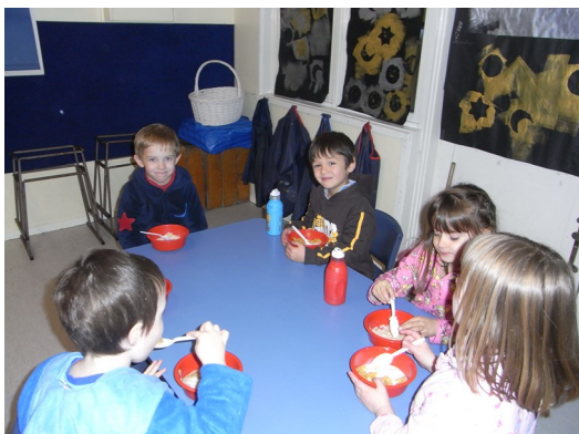
Pj Day & Breakfast at Kinder

Here's a snapshot of what we've been up to during Term 3.... We've been busy !